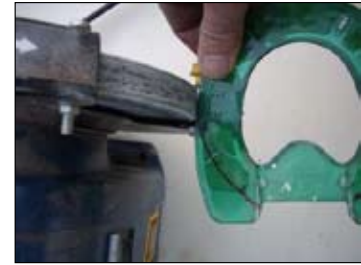
Ground down with a grinder.